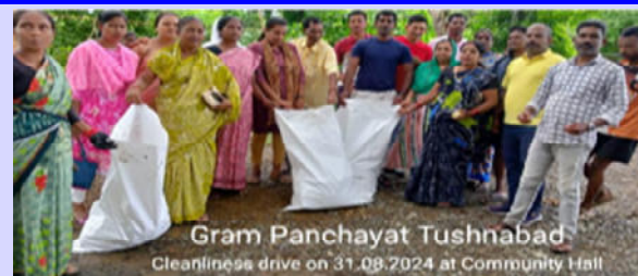
Gram Panchayat Tushnabad Cleanliness drive on 31-08-2024 at Community Hall

This initiative, driven by the collective efforts of Panchayati Raj Institution (PRI) members and Government officials including BDOs, EOs, Panchayat Secretaries, VLWs/GSSs, MTS, DRMs, Contract Staff and other line Departments, marks a crucial step towards sustainable waste management and the